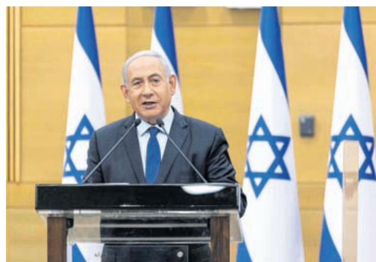
Israeli Prime Minister Benjamin Netanyahu speaks to the Israeli Parliament in Jerusalem, Sunday, May 30, 2021.

In March 2020, Lebanon defaulted on paying back its debt for the first time in its history as the local currency lost more than 85% of its value. Tens of thousands have lost their jobs while many others left the country seeking opportunities abroad. Nearly half the country's 5 million people live in poverty. □